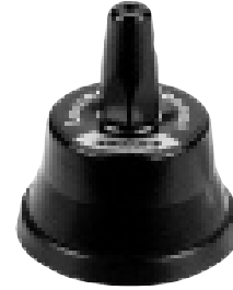
Black UHF base for NMO mounts