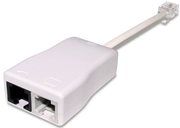
Z-330P2J2 xDSL over POTS CPE In-Line Filter

The Z-330P2J2 is a small, in-line, ANSI T1.421-compliant customer premises equipment (CPE) filter designed to expedite the service delivery and improve the performance of digital subscriber line (DSL) and home phonenumber network (HPN) services over plain old telephone service (POTS). The Z-330P2J2 filters all telephones, facsimile (fax) machines, answering machines, and other telephone equipment. Its third-order filter design electronically isolates the high-speed DSL and HPN data streams from the voice-band POTS to provide premium voice quality and optimal DSL and HPN data rates.